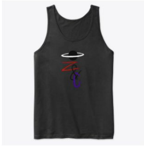
Z and C Logo Premium Tank Top