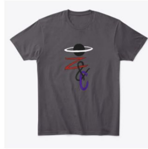
Z and C Logo Comfort Tee