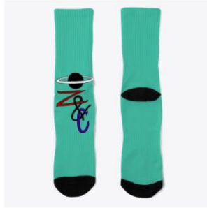
Z and C Logo Crew Socks